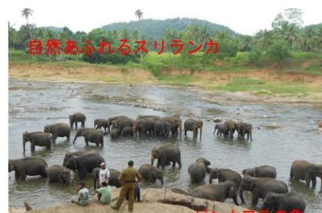
Fig. 16 Enjoying Bathing!

4% of the forests disappeared these 10 years. It may be necessary if we need to develop economically but I cannot help feeling a little sad. I hope that we can develop economically and protect our precious nature at the same time. Elephants live in the dried areas and go to the nearest rivers or lakes. They enjoy playing with water and washing their bodies too.