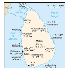
Fig.2 Sri Lanka