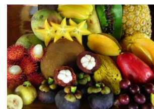
Fig.12 Variety of Delicious Fruits

Next thing to introduce to you must be a variety of delicious fruits. Bananas, Mangos, pineapples, papayas, avocados, durians and rambutans etc. Even bananas, we have twenty kinds of them. To talk about palm, the coconut, we always use coconut milk for cooking and also drink them. It has liquid inside tasting like POCARI. We can make Sri Lanka