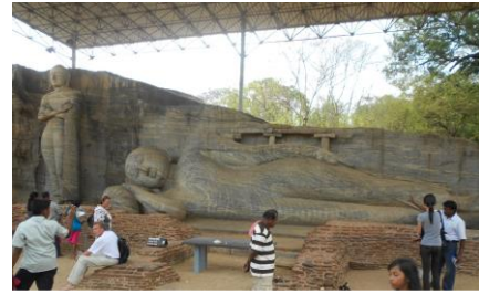
Fig.8 Reclining Buddha's Image

Polonnaruwa, the second most ancient kingdom of the country is one of the World Heritage Sites. And the Gal Vihara is a rock temple of the Buddha situated in the ancient city of Polonnaruwa in North Central Province, Sri Lanka. The central feature of the temple is four images of Buddha, which have been carved into the face of a large granite rock.