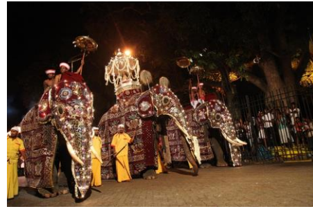
Fig. 15 Perahera Holy Festival

They train some of them and use them for the ceremonies. Adorning them with some gorgeous garments and light them up, and parade 80 to 100 elephants along with drums or flutes music. (Fig. 15 Perahera festival) People from all over the world come to Kandy City in the central area to view and enjoy it. Especially, once in a year, they show the Sacred Tooth Relic of Lord Buddha, they choose the greatest elephant and carry the image on its back. And other than that, a lot of elephants are used for tourism business.