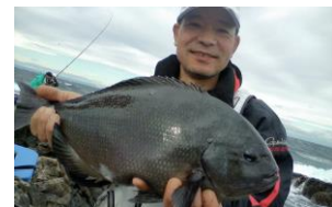
Fig.3 My Beloved Husband