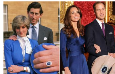
Fig.11 Royal Family Members