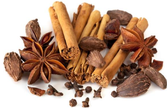
Fig.13 Precious and Useful Spices

There are a variety of herbs, of course! These spices are very good to our health. Ayurveda is known as a new medicinal science, but to tell you the truth, it is a traditional therapy originated from 5,000 years ago. This is a method of treatment using medicinal