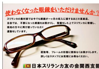
Fig. 20 Leaflet asking for donations of glasses

Former President Jayewardene helped bring peace to Japan. When he died at the age of 90, he donated his corneas; one went to a woman in Nagano Prefecture, and another to a Sri Lankan citizen. Following in the footsteps of the former president, I too hope to continue friendly relations between these two countries.