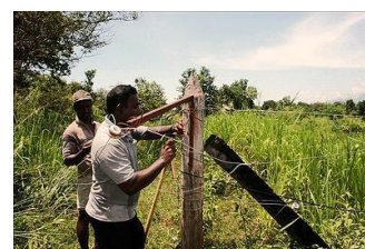
Fig. 19 Installing electric fences

Some regions have begun building electric fences (Fig. 19) to prevent elephants from leaving the forest. There are also recent efforts to plant thorny trees, such as lemon and bougainvillea, to act as a natural fence. In the northern part of Sri Lanka, such natural fences cover 33 km and surround 10 villages. Elephants can also sense dur