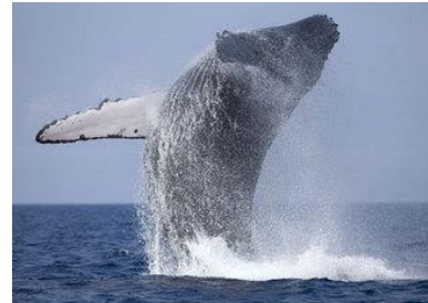
Fig.14 Blue Whale!

Now to talk about animals, we have the biggest animals both on the land and in the sea. Yes, they are elephants and blue whales. (Fig. 14) I think that there are no other countries than Sri Lanka where we can see both the biggest animals in a country. The whale can be watched between in November and April in the southern ocean area.