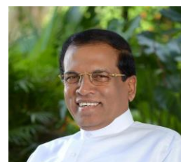
Fig.4 Sitting President Maithripala Sirisena

Sri Lanka is located 6,800km remote from Japan. It takes 9 hours to get there by plane. We have direct flights from Tokyo. The time difference is minus three and a half hours. Sri Lanka is really beautiful, which is called “Pearl of the Indian Ocean.” Colombo was the capital before, but now Kotte is the official capital. Its formal name is Sri