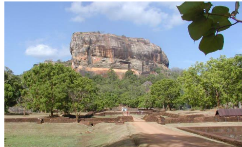
Fig.7 Sigiriya Rock Fortress

As I said before, we have 8 World Heritage Sites in our country, and they are loved by many people within and outside Sri Lanka.