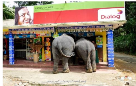
Fig.17 Elephants Shopping?

Unfortunately, we are experiencing severe trouble recently. The Fig. 17 shows two elephants nosing in a shop that I think is a mobile phone shop, and I don't think that they are buying phones there.