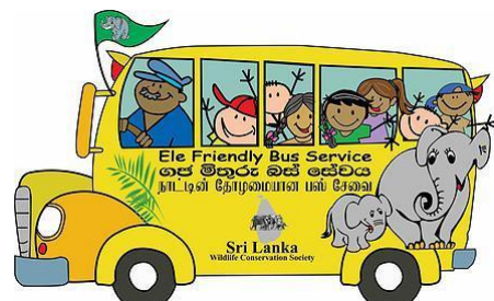
Fig.18 Encountering an elephant on the way to school - safer on a bus!

they only kill an elephant, they can receive large sums of money. Now there are even people who capture young elephants and sell them. For this kind of business, one elephant can sell for 50,000 to 170,000 rupees within the country. In some cases, hunters kill the parent elephants in order to capture these young elephants. Because much of the country is forest, there are roads that cross through the forests connecting the various villages. Young children travel these roads on the way to school, sometimes encountering wild elephants; occasionally the elephants attack.