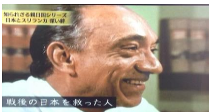
Fig.9 The 2nd President Jayawardene

In 1985, a very beautiful House of Parliament and a general hospital were built in Kotte thanks to the ODA of Japan. And then, this city became the official capital. The civil war for 26 years was ended in 2009. My sister's husband died during the war. He was a colonel, working as a commander for the intelligence headquarters. Still now, there are a lot of land mines buried in the northern part of the country and they are deadly dangerous. So the Tamils originally living there still cannot go back to their home. Japanese government sent 164 million Sri Lankan rupee in order to remove those land mines this March.