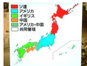
Fig.10 Dividing and Governing Plans(in 1945)

Do you know this gentleman?(Fig.9) He is Mr. J.R. Jayawardene, one of the Sri Lankan Presidents. It was thanks to him that Japan was not divided and governed. There was a plan to divide Japan into several parts and govern it like the Fig.10 just after the WW II. Sri Lanka was air raided by Japan army in April, 1942 at Colombo and Trincomalee where Britain's army base was. The war World War II was ended on August 15th, in1945.