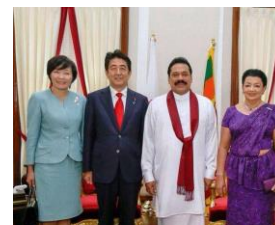
Fig.5 Former President Mahinda Rajapaksa

We changed the government this January. We have 8 world Heritage sites in our country. The new President, whose name Maithripala Sirisena, is from an ancient city, Polonnaruwa, which is one of the world heritage sites. He grew up in a farmer family and he is going to make much of agricultural policies.